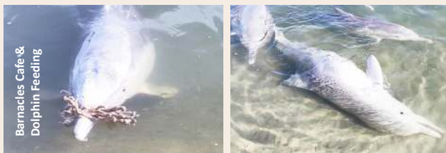
Barnacles Café &amp; Dolphin Feeding