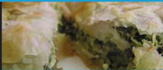
Spinach and Cheese Pie (Filo pastry filled with spinach and cheese)