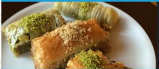
Baklava (Filo pastry, nuts and honey)