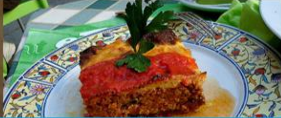
Moussaka (Minced lamb, aubergine and tomato)