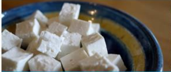
Feta cheese (Made with sheep and goat milk)

Small cafes, called Tavernas, serve delicious Greek food.