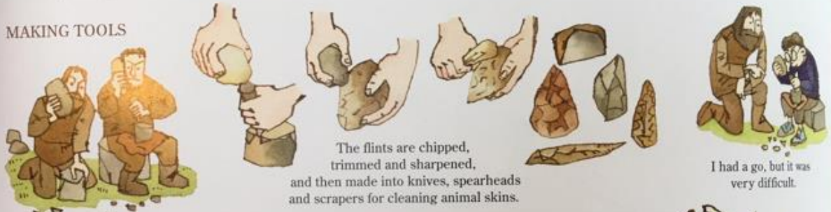
The flints are chipped, trimmed and sharpened, and then made into knives, spearheads and scrapers for cleaning animal skins.