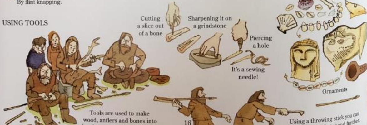
Cutting a slice out of a bone