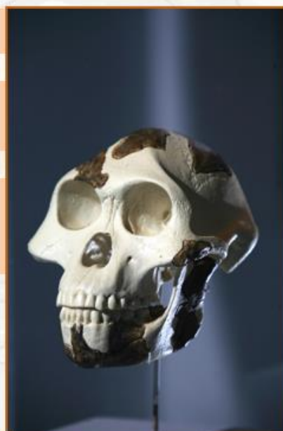
Photo courtesy of Todus magazine twinkl.com - granted under creative commons licence - attribution

There is no recorded history of this time that we can read, just clues left behind that archaeologists have to interpret.