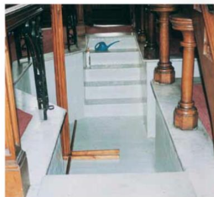
▲ ③ In some churches, people are baptised by putting their whole body underwater. In these churches, a very large font called a baptistry is used.

The first Christians were baptised, like Jesus, as adults. Some adults also want to be baptised. Many people feel that Baptism at this stage of life is like being born all over again. In fact, some Christians, for example, the Baptists, feel that it is important to put their whole body underwater during Baptism, and so their font is actually a small pool (picture ③). This kind of font is sometimes called a BAPTISTRY .