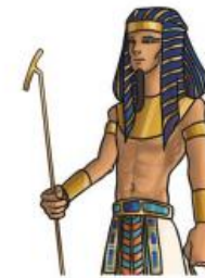
Valley of the Kings starts and pharaohs are buried with their treasures.