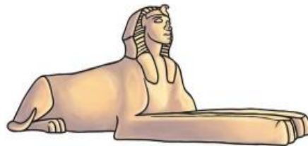
The Great Sphinx is built.