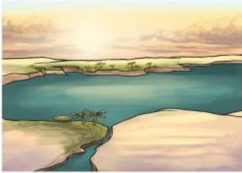
The first settlers arrived in the Nile Valley.