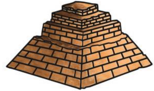
The first pyramid is built.