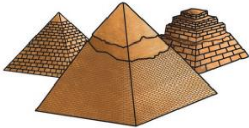
The Giza pyramids are built for the kings Kufu, Kharfe and Menkaure.