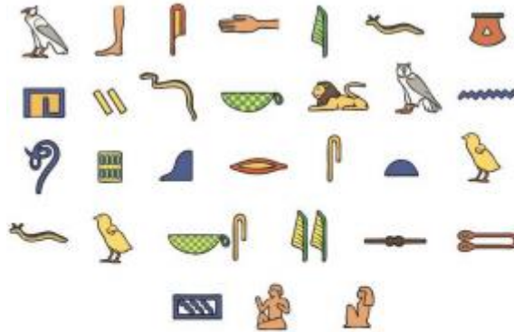
Hieroglyphs are used to keep trade records.